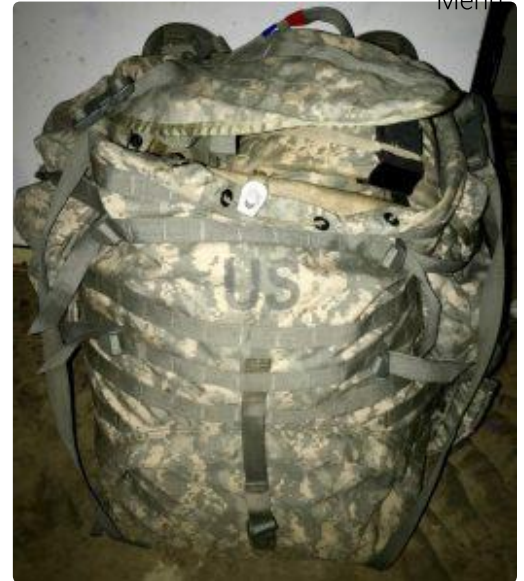
This program is designed to help veterans who've sacrificed to help so many.