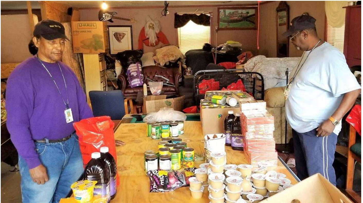
Veteran volunteers assemble rucksacks to be distributed to other veterans through the VHMC of Central Alabama. (Mark Rubino)