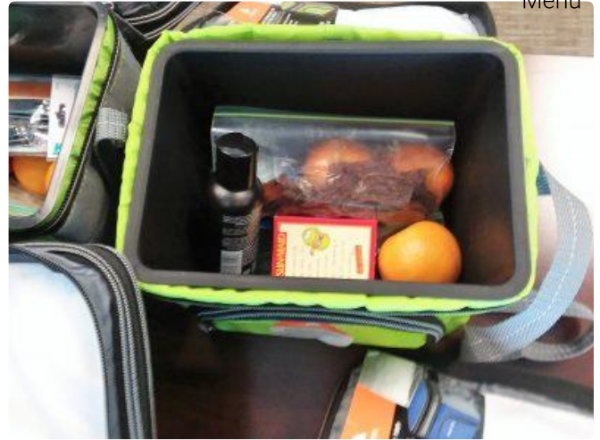
The rucksacks assembled by VHMC contain healthy and positive items, prepared by veterans for veterans.

Handing out the rucksacks and taking care of veterans not only helps them, but helps the veterans who give time and effort.