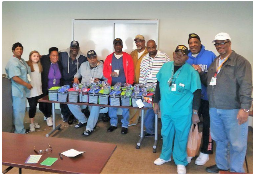
Veteran volunteers enjoy doing things to help other veterans.