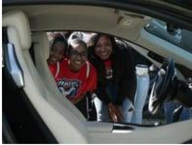
(//vimeo.com/266164973) Alabama Power hosts Education Event at Honda Indy Grand Prix for students (//vimeo.com/266164973)