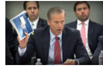
CBS This Morning GOP reaches tax deal