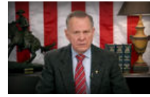
CBS This Morning Roy Moore won't concede