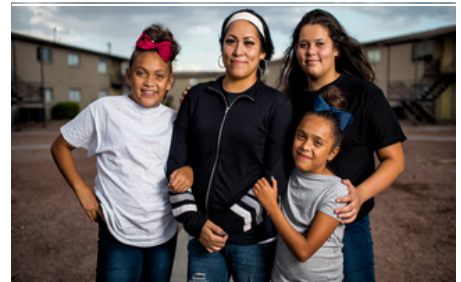
Sponsored by Salvation Army