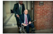
CBS This Morning John McCain hospitalized