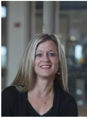
Kym Klass, Montgomery Advertiser (Photo: File)

Mental health: How Alabama is responding (/story/news/2017/10/06/alabama-mental-health-protect-our-consumers/727493001/)