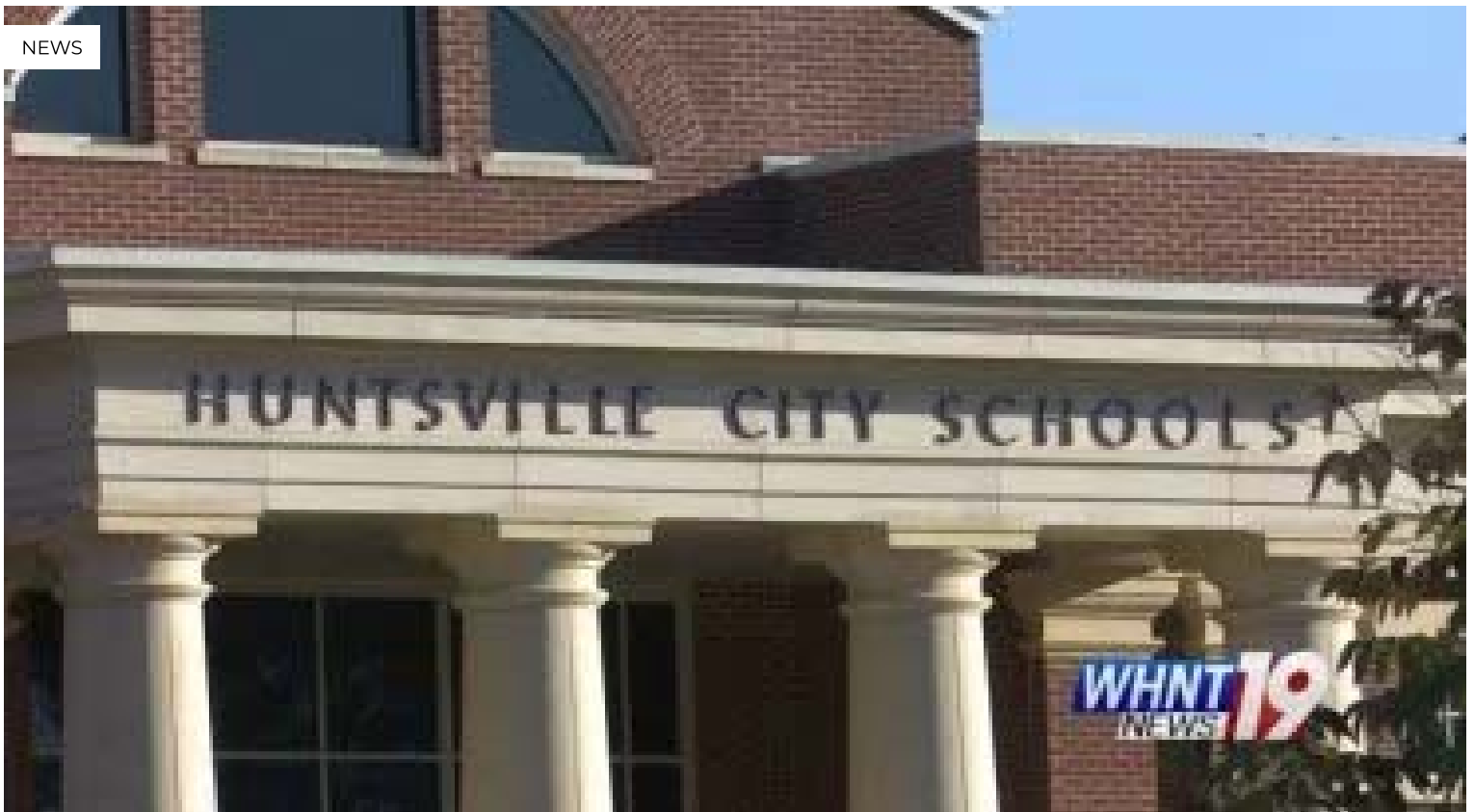
Three Huntsville City Schools appear on state list of failing schools