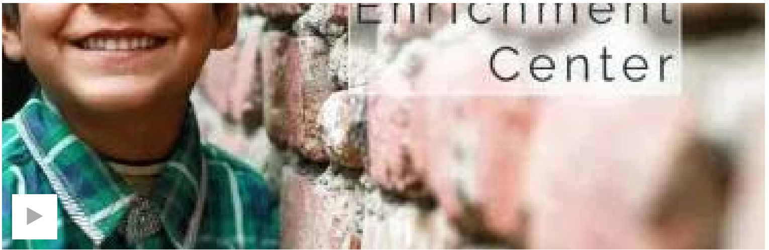
Former educator works to provide students with free mental health care options in schools