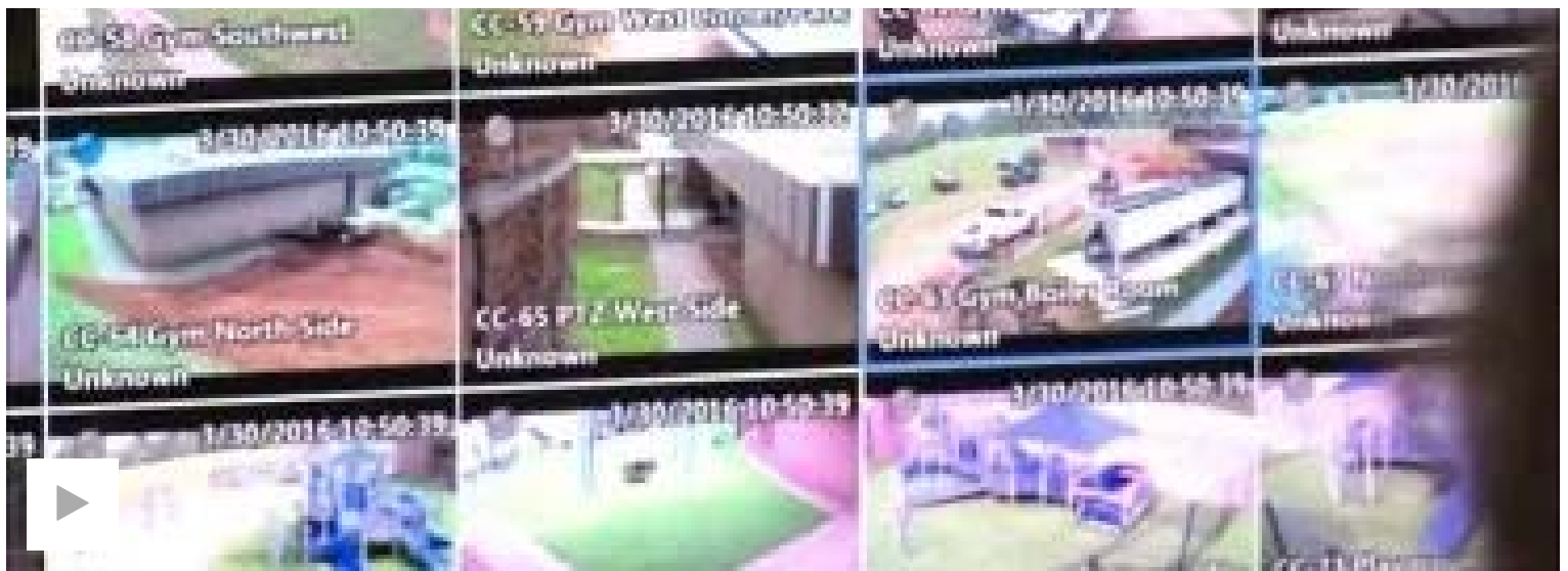
Huntsville City Schools exploring future of security and school safety