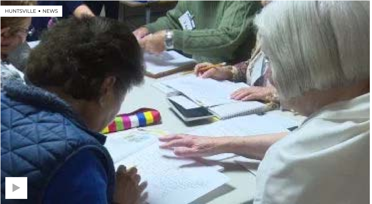
First Baptist Church's ESL program helped thousands learn English for over more than 50 years