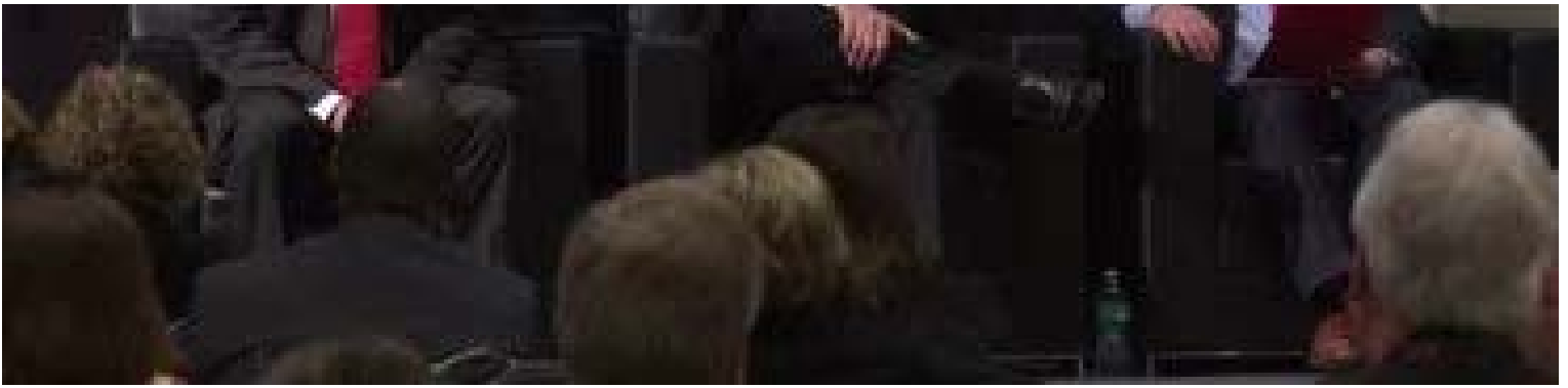
Madison County School systems host State of the Schools address