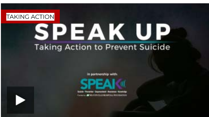
SPEAK Up: Taking Action to