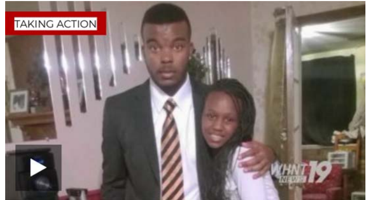
Suicide loss survivor turns grief into action by writing book to help save other children in crisis