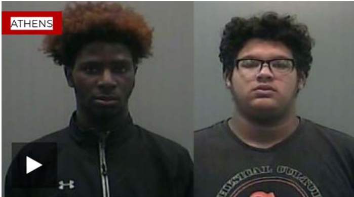
Clements High School parents worried after vandals shoot two vehicles