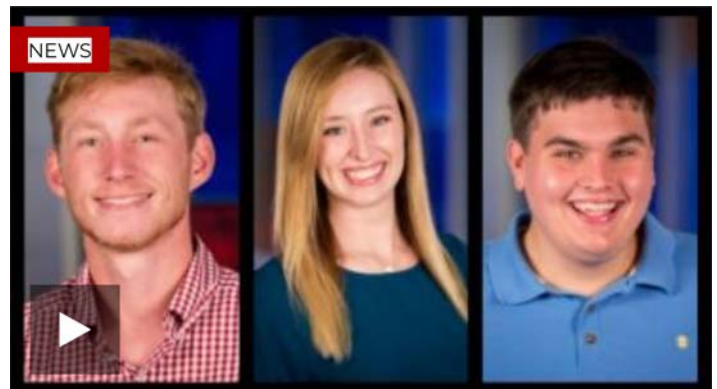
Happy National Intern Day! Meet the WHNT News 19 interns