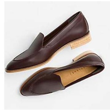
Angelina Jolie's New Go-To Travel Shoe Is Surprisingly Affordable Vogue