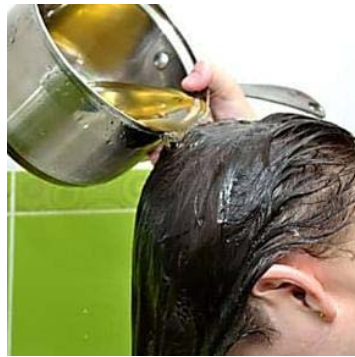
If You Have Thinning Hair, Watch This Now Vital Updates