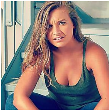
Here's Why You Should Stop 'Googling' Names BeenVerified.com