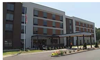
Irma evacuees travel to east Alabama Sponsored | WSFA