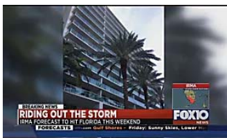
Man & friends to ride Irma out in 6th story South Beach highrise Sponsored | WSFA - video