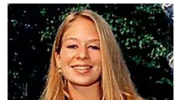
Natalee Holloway's Story Finally Get's An Ending Sponsored | HorizonTimes