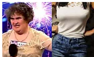
After Losing 70 Lbs. Susan Boyle is Unbelievably Gorgeous Sponsored | Smartied.com