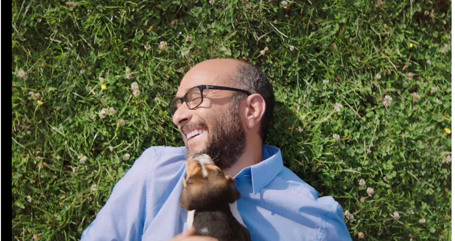
Democrat Maddox speaks about Mental Health plan

By Lydia Nusbaum | September 24, 2018 at 8:34 PM CDT - Updated September 25 at 9:46 AM