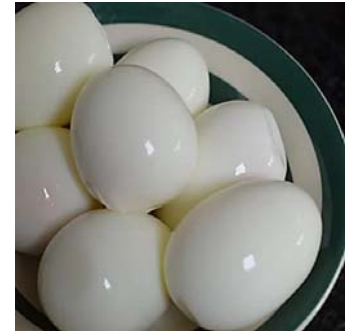
Constant Fatigue Is A Warning Sign – See The Simple Fix Health Headlines