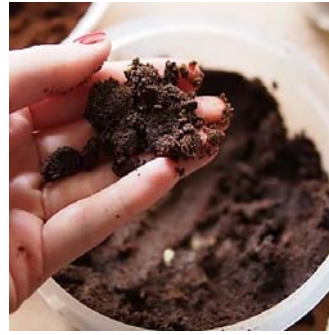
How to Remove Dark Spots Vital Updates