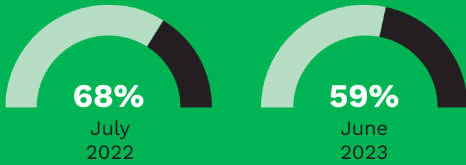
Percent decline in answer rate due to reduction of a call center